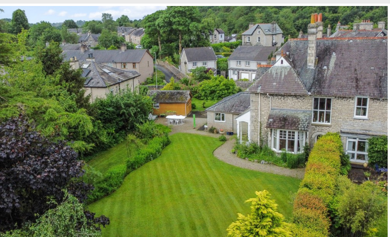
Aerial Garden Shot