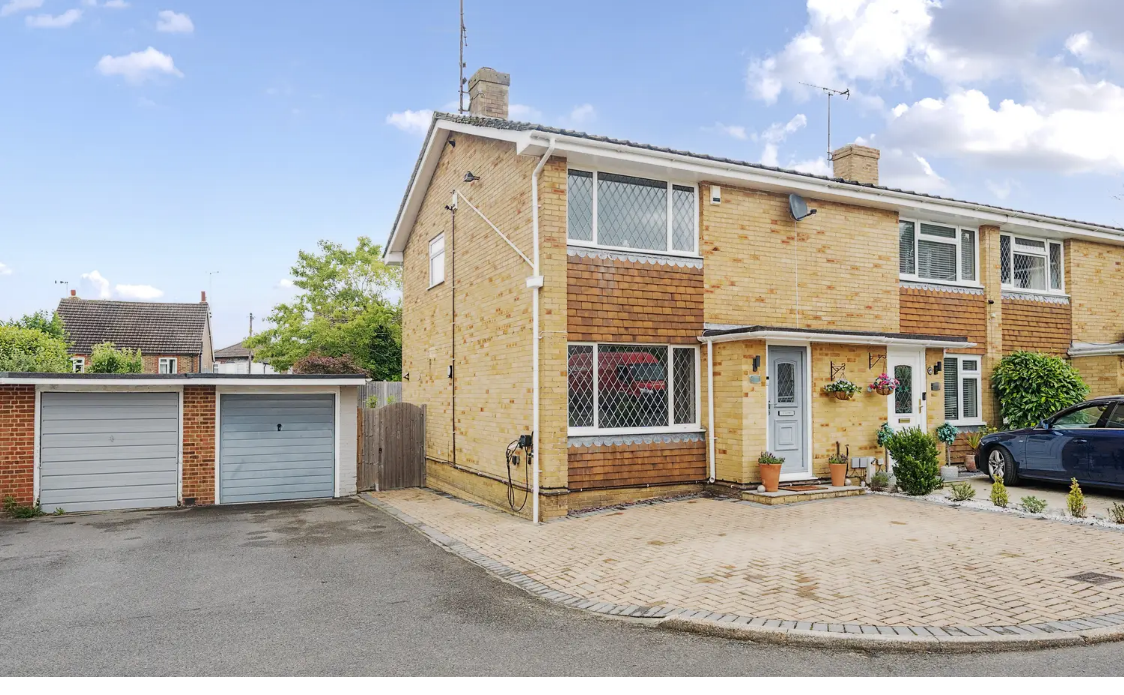
35 Butlers Road, Horsham Guide Price £400,000