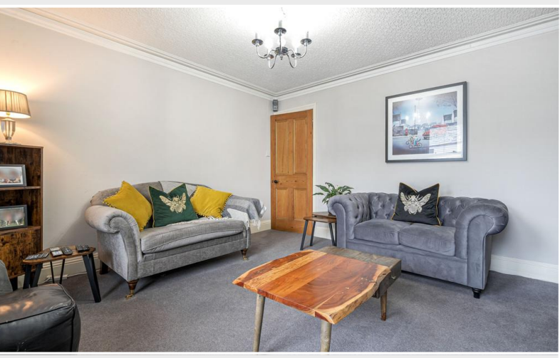
Living Room/Bedroom Two