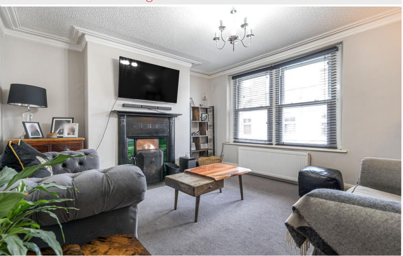
Living Room/Bedroom Two