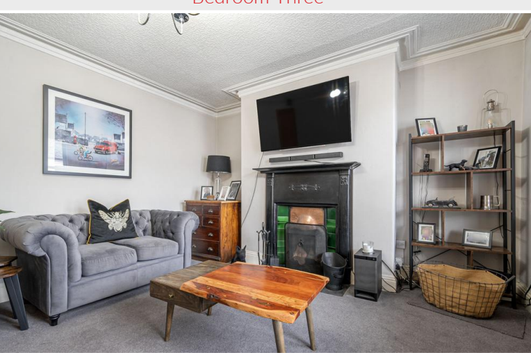
Living Room/Bedroom Two