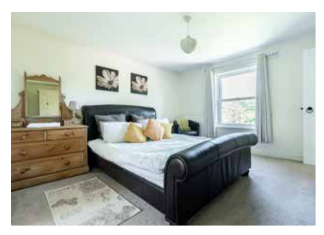
Each of the bedrooms are blessed with lovely views.