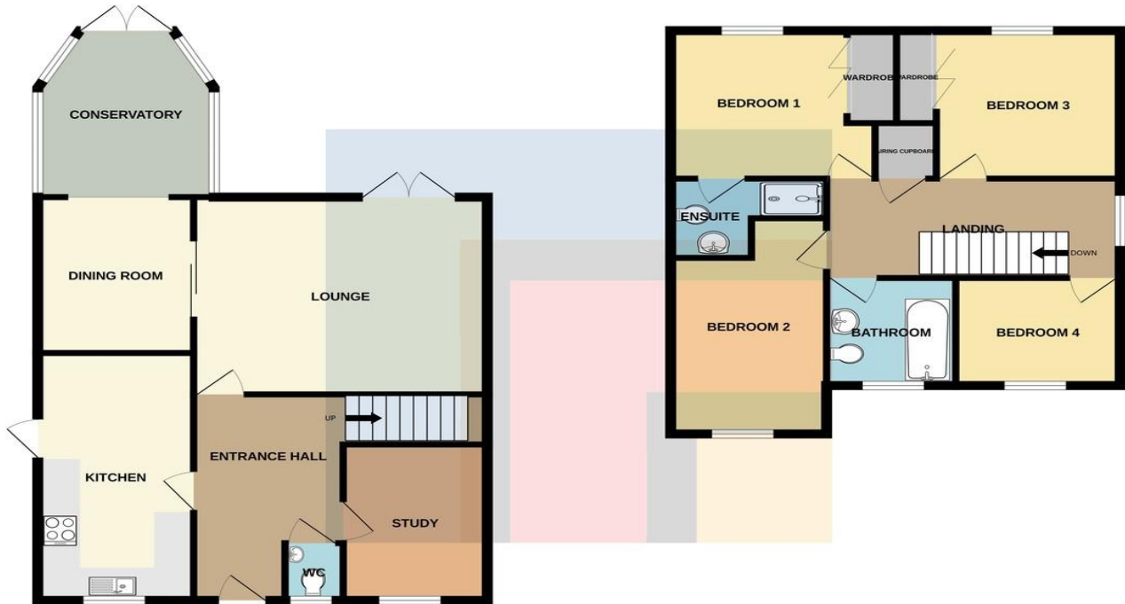
1ST FLOOR 587 sq.ft. (54.5 sq.m.) approx.

TOTAL FLOOR AREA: 1318 sq.ft. (122.4 sq.m.) approx. Whilst every attempt has been made to ensure the accuracy of the floorplan contained here, measurements of doors, windows, rooms and any other items are approximate and no responsibility is taken for any error, omission or mis-statement. This plan is for illustrative purposes only and should be used as such by any prospective purchaser. The services, systems and appliances shown have not been tested and no guarantee as to their operability or efficiency can be given. Made with Metrofix ©2024.