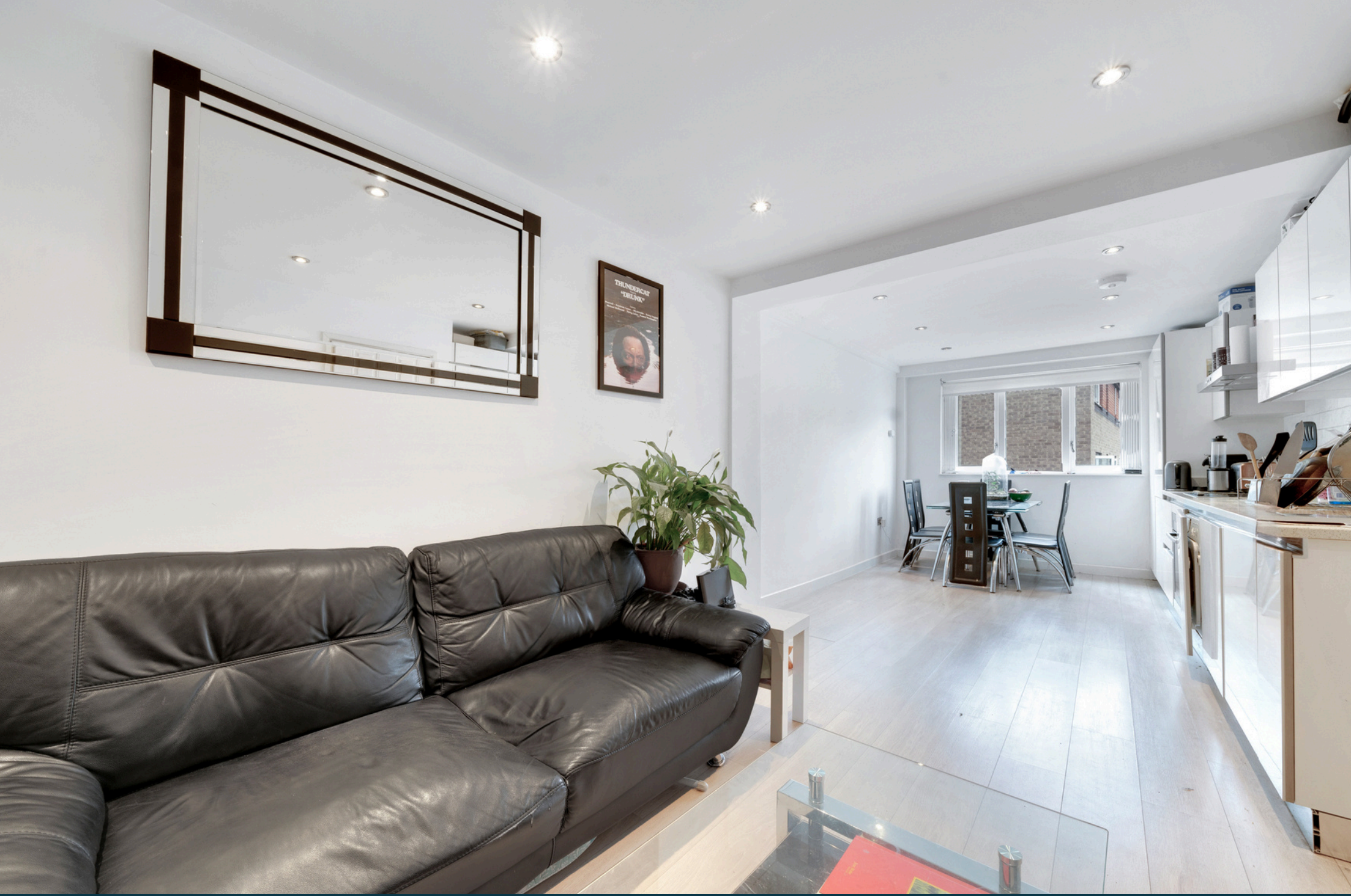
FABIAN HOUSE, 141-143 CANNON STREET ROAD, LONDON, E1 2EZ