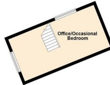
First Floor Approx. 19.6 sq. metres (210.8 sq. feet)

Total area: approx. 188.7 sq. metres (2030.9 sq. feet)