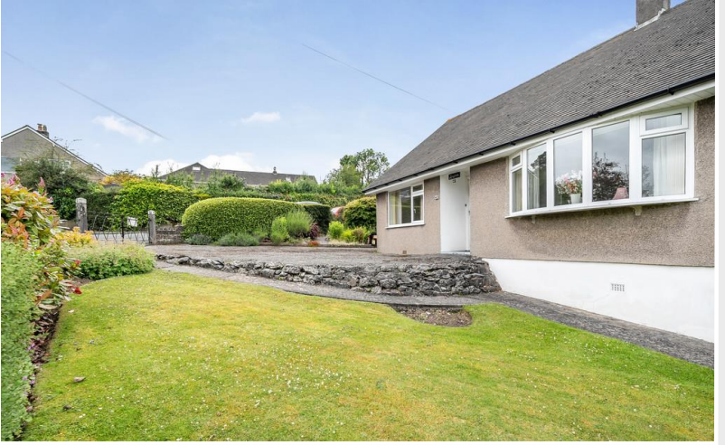
40 Swinnate Road