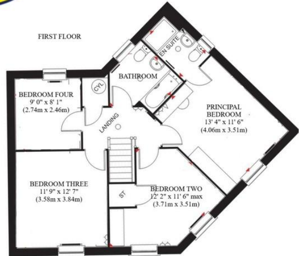
FLOOR PLAN Not to Scale Please use as a guideline only