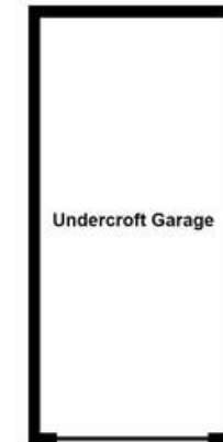
Garage Approx 12 sq m / 133 sq ft

This floorplan is only for illustrative purposes and is not to scale. Measurements of rooms, doors, windows, and any items are approximate and no responsibility is taken for any error, omission or mis-statement. Icons of items such as bathroom suites are representations only and may not look like the real items. Made with Made Snappy 360.