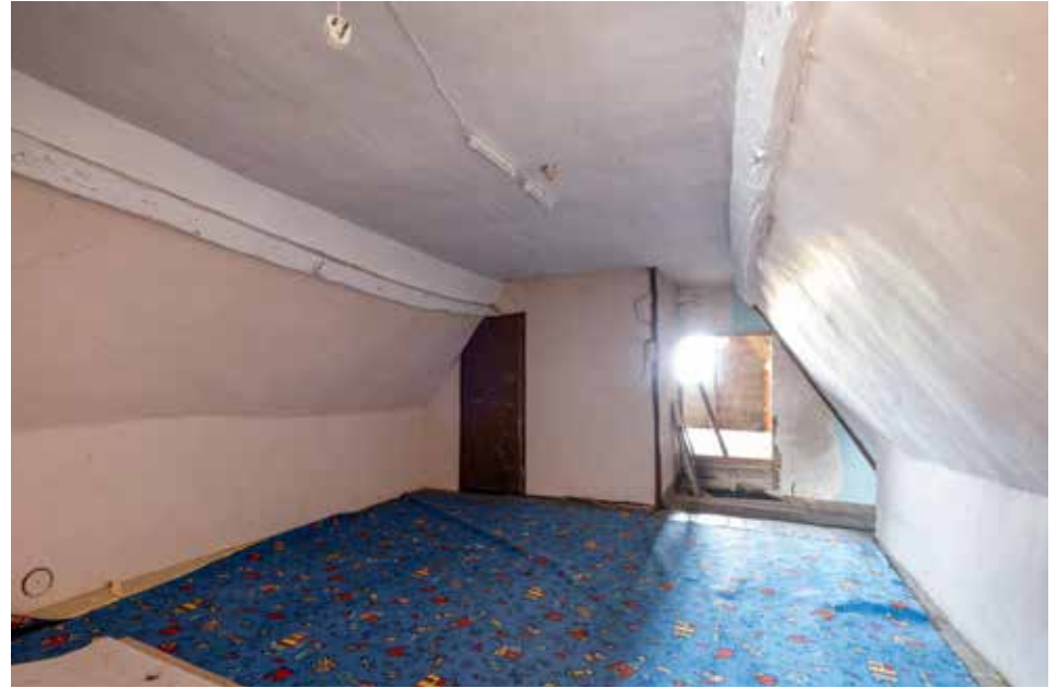
Attic Rooms - Main House