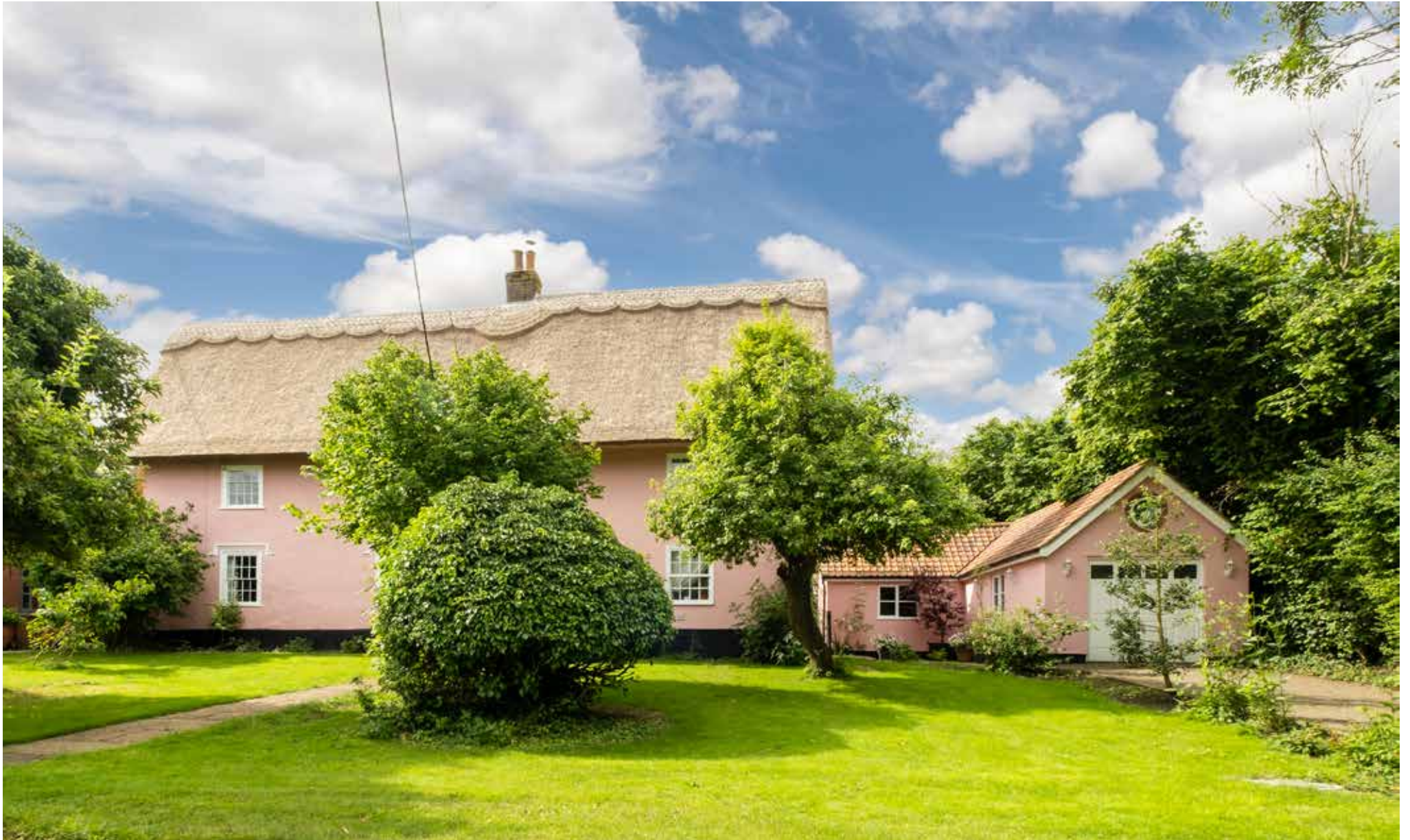
Foundation House Mill Street | Gislegham | Suffolk | IP23 8JT