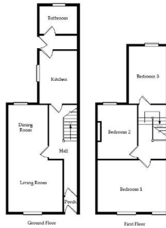
This drawing is for illustrative purposes only (not to scale) Copyright © 2014 ViewPlan.co.uk (Ref: VPS1-KFF-1, Rev: A)