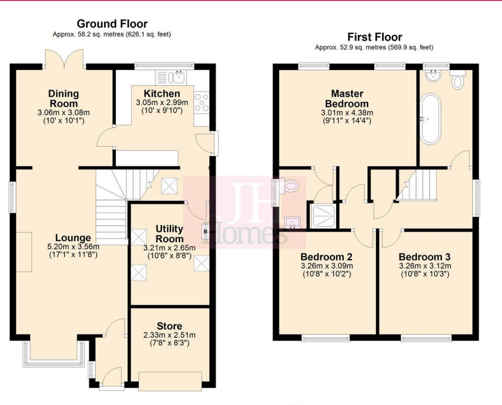
Total area: approx. 111.1 sq. metres (1196.0 sq. feet)