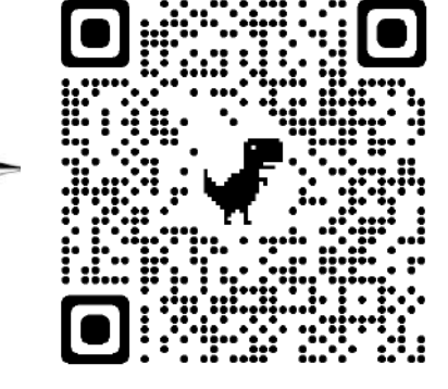
Scan to View Video Tour

Total Floor Area Approx. 95m2 (1,022 sq ft)