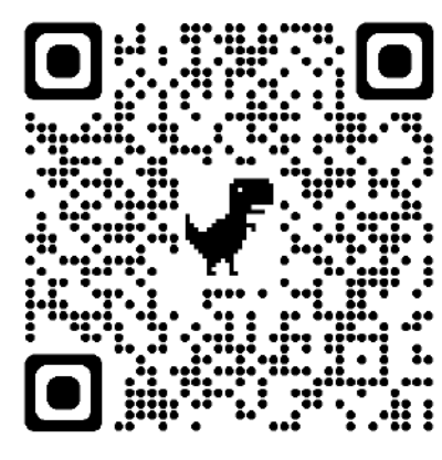
Scan to View Video Tour