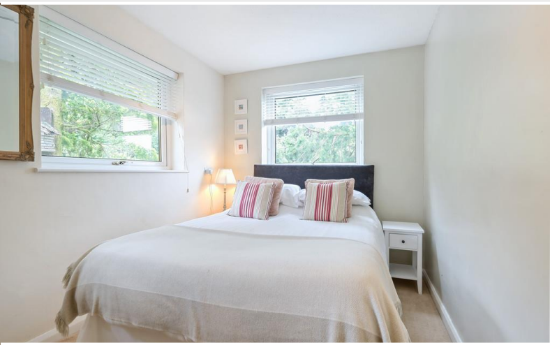
Bedroom 3 Fell Rigg Howe Ordnance Survey Plan

changing needs. Current accounts available upon request.