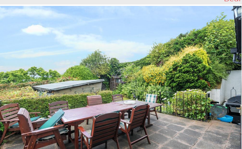
Patioed Seating Area