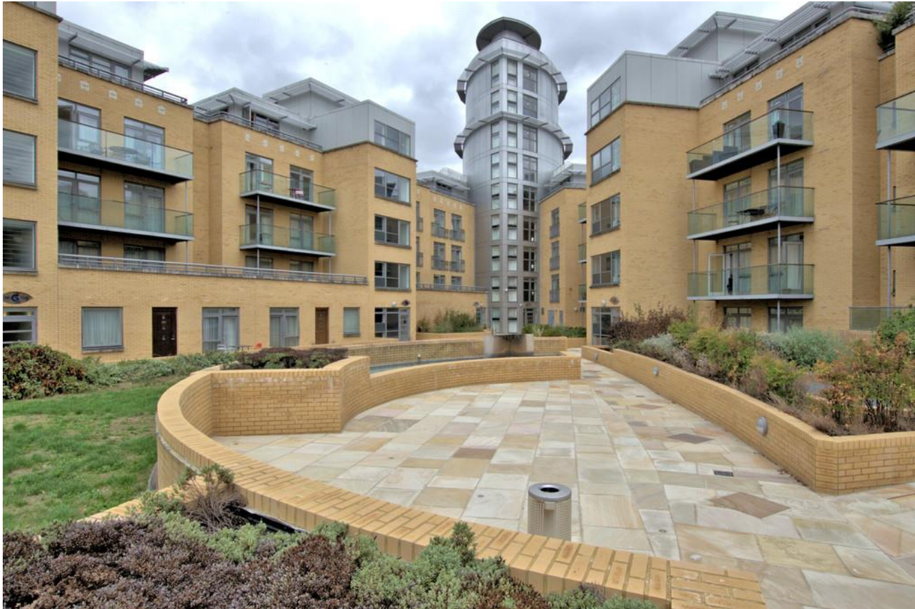
The Belvedere, Homerton Street