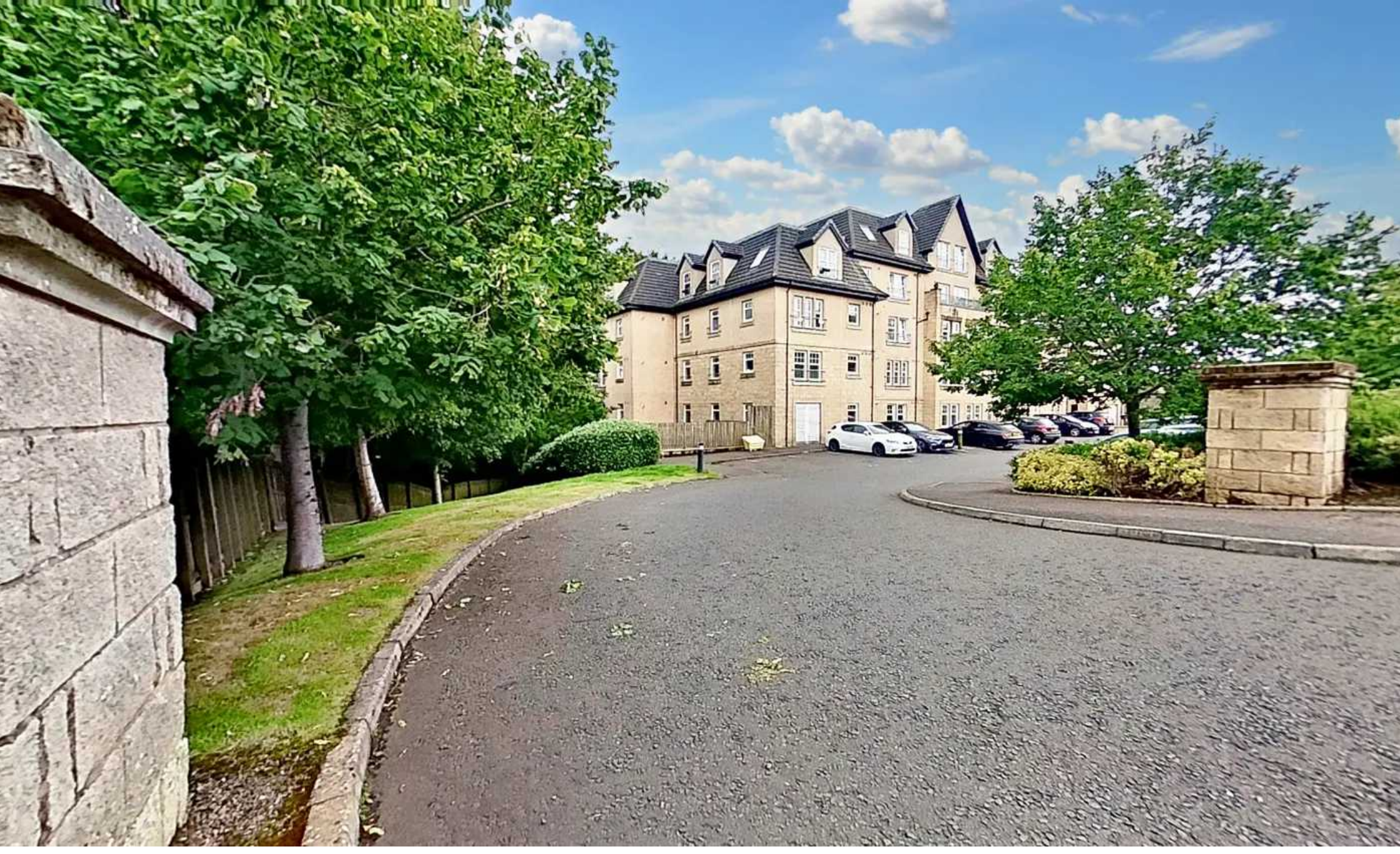
Flat 4, 141 Marina Road, Bathgate Offers Over £132,000