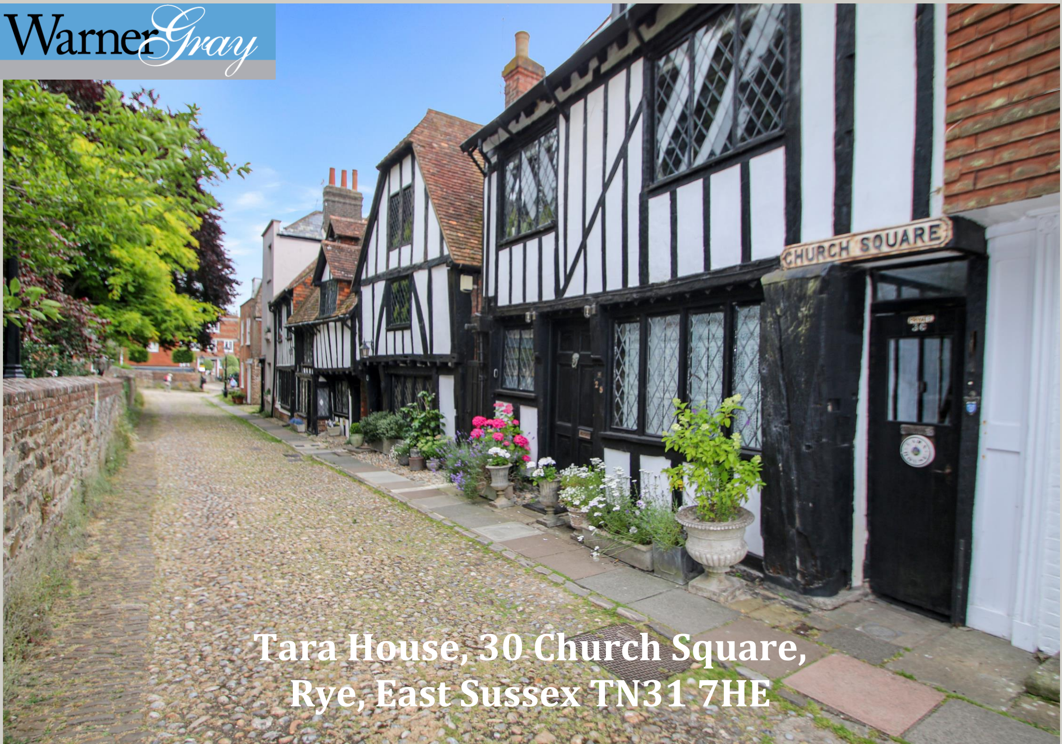
Tara House, 30 Church Square, Rye, East Sussex TN31 7HE