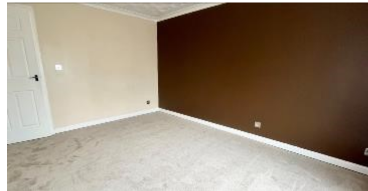
9 Gilsay Court