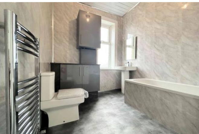
BATHROOM 2.5 x 2.5m (8'2 x 8'2)

Larger than your average bathroom with modern, marble effect wall panels is this newly fitted white bathroom suite comprising of a bathtub with a chrome mixer tap, pedestal sink with a matching mixer tap and a low flush toilet. Completing the room to a high spec are modern fitted units, chrome towel radiator and a UPVC window. There is a matching cabinet which houses the Baxi combination boiler.