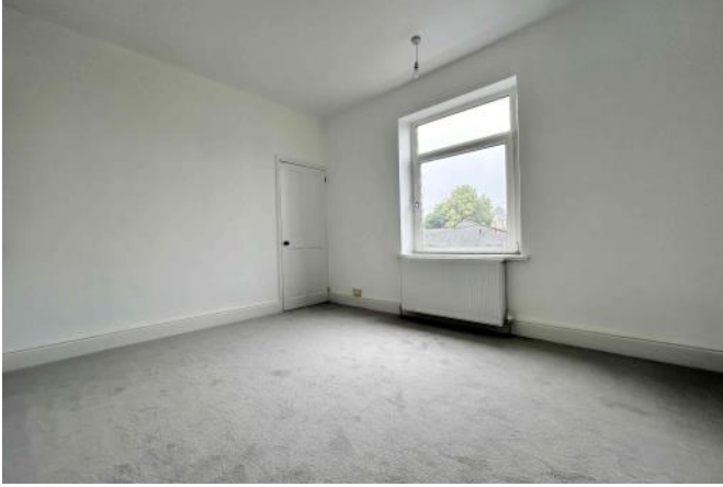
BEDROOM TWO 2.7 x 3.4m (8'10 x 11'1)

This bedroom is large enough to section off a corridor to enable a private bedroom and complete separate access to the loft room.