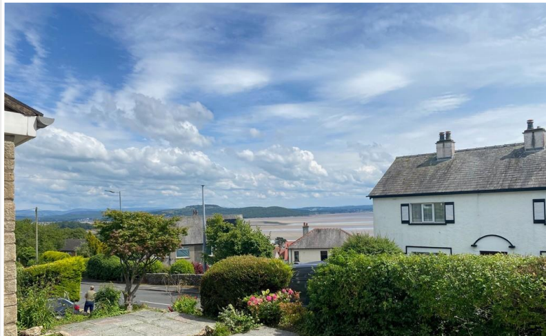
View from Kitchen