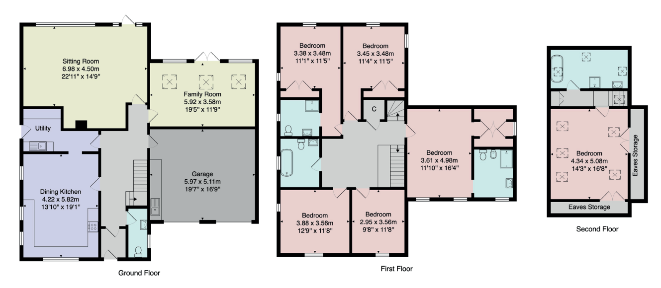
Total Area: 309.1 m² ... 3328 ft² All measurements are approximate and for display purposes only. No liability is accepted by either the agency or Box Property Solutions Ltd as to the exact measurements of the rooms. Box Property Solutions Ltd retains the copyright on this plan and allows agents to use it with agreed permission.