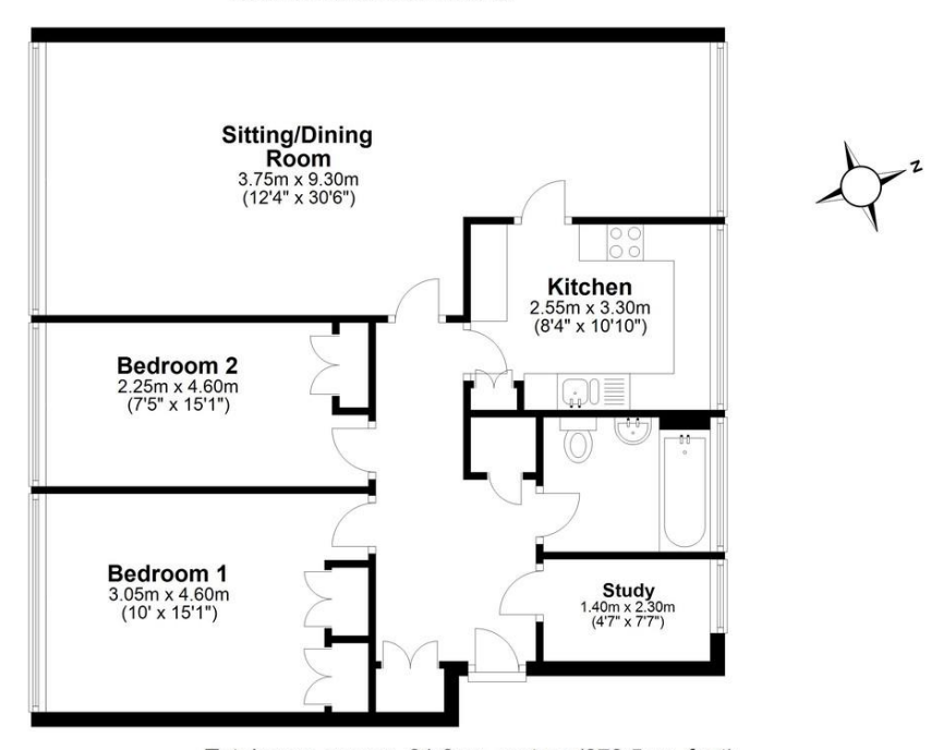
Total area: approx. 81.6 sq. metres (878.5 sq. feet)

Approx. 81.6 sq. metres (878.5 sq. feet)