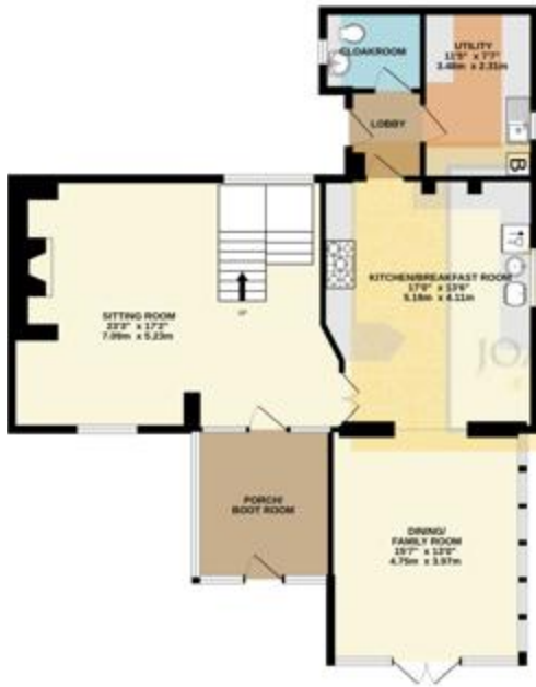
GRANARY - GROUND FLOOR 1029 sq.ft. (95.6 sq.m.) approx.