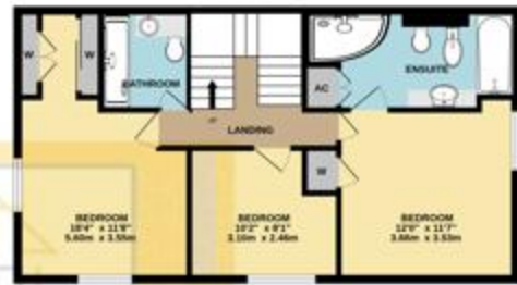
GRANARY - SECOND FLOOR 442 sq.ft. (41.1 sq.m.) approx.