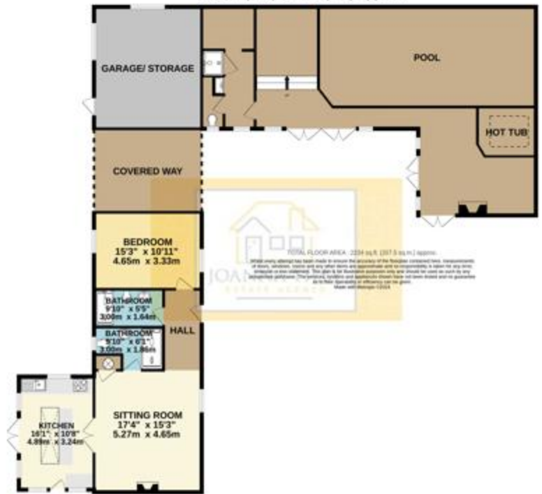
GROUND FLOOR 2234 sq.ft. (207.5 sq.m.) approx.

Whilst every attempt has been made to ensure the accuracy of the floorplan contained here, measurements of doors, windows, rooms and any other items are approximate and no responsibility is taken for any error, omission or mis-statement. This plan is for illustrative purposes only and should be used as such by any prospective purchaser. The services, systems and appliances shown have not been tested and no guarantee as to their operability or efficiency can be given. Made with Metroplan ©2024