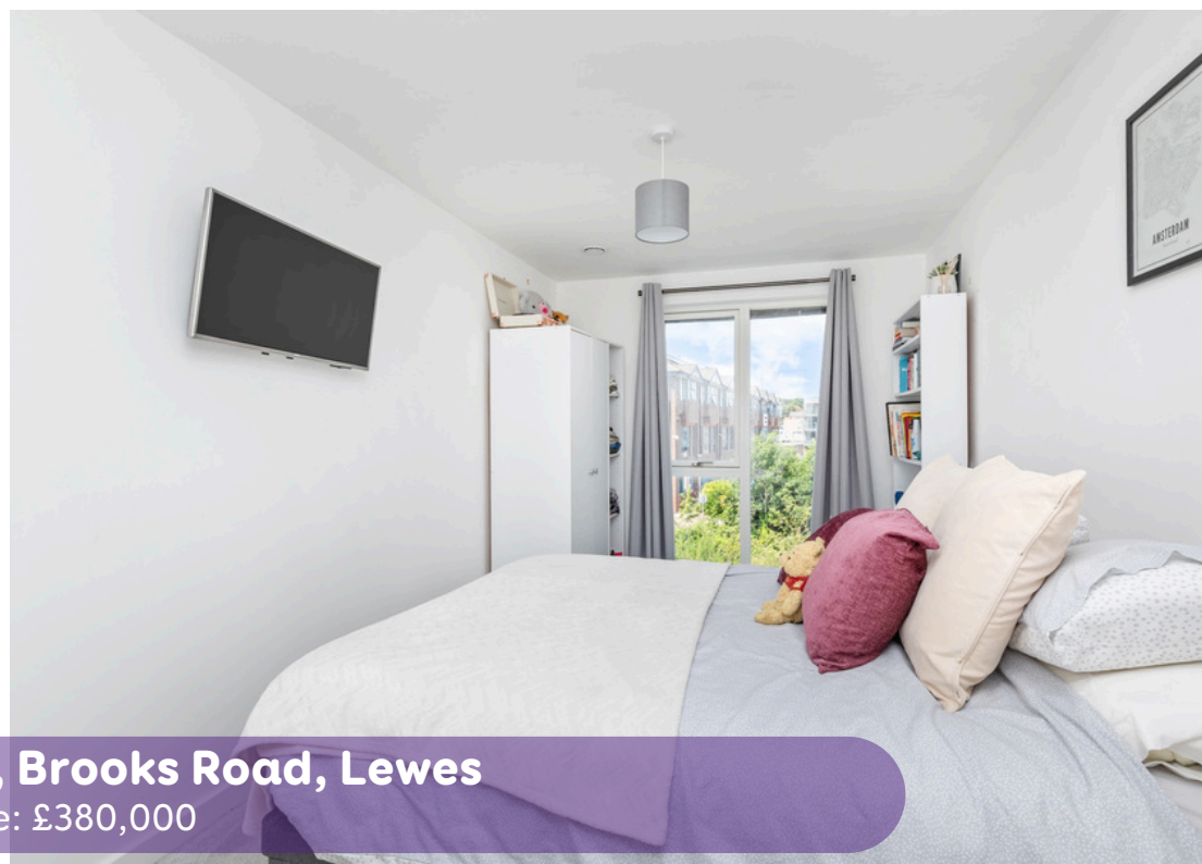
Flat 3 Artisan House, Brooks Road, Lewes Fixed price: £380,000