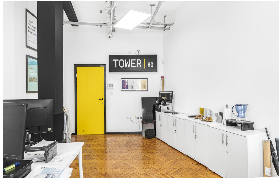
Rear Office, 16G Perseverance Works, London, E2 8DD