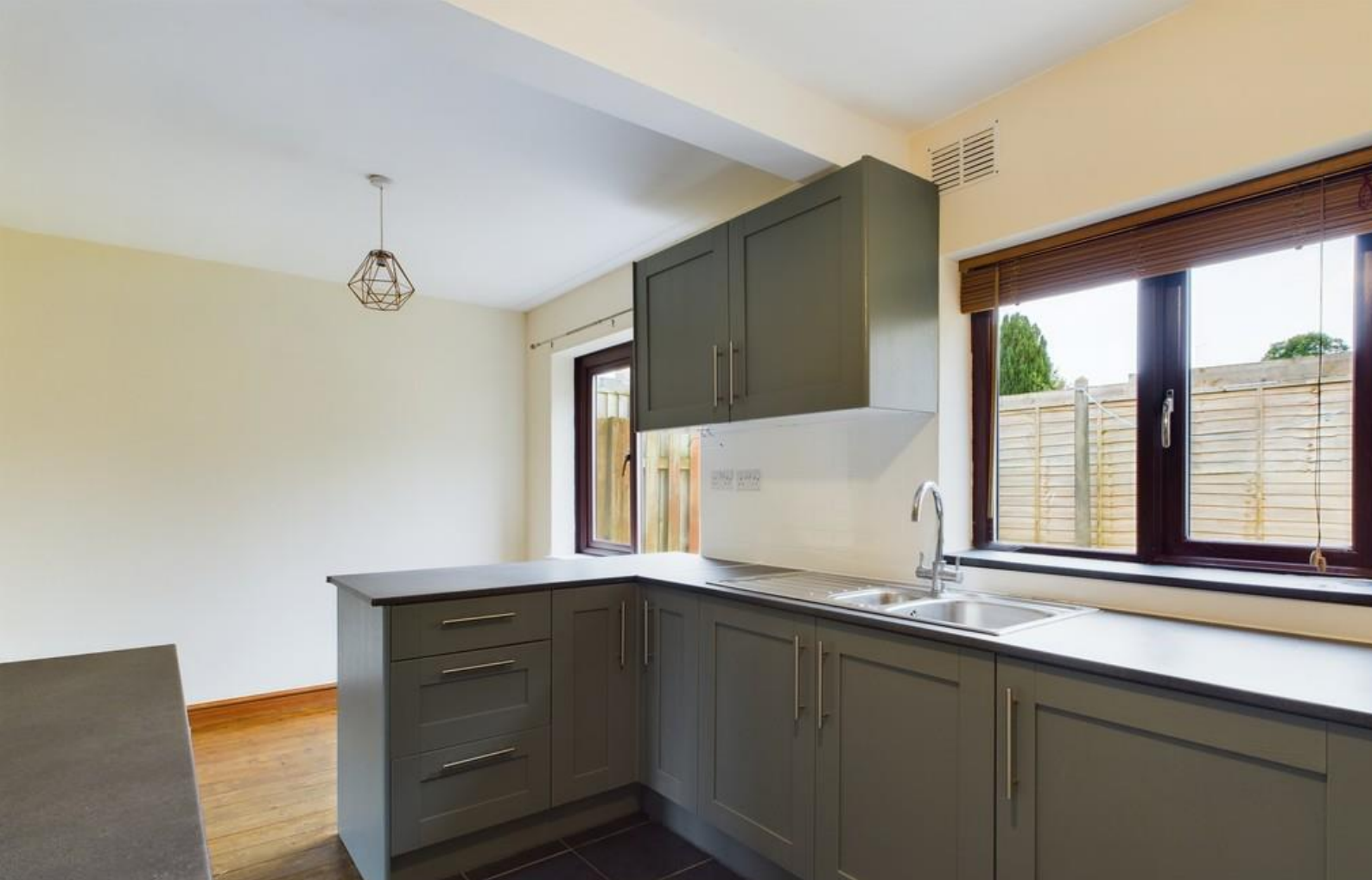
Kitchen Dining Room