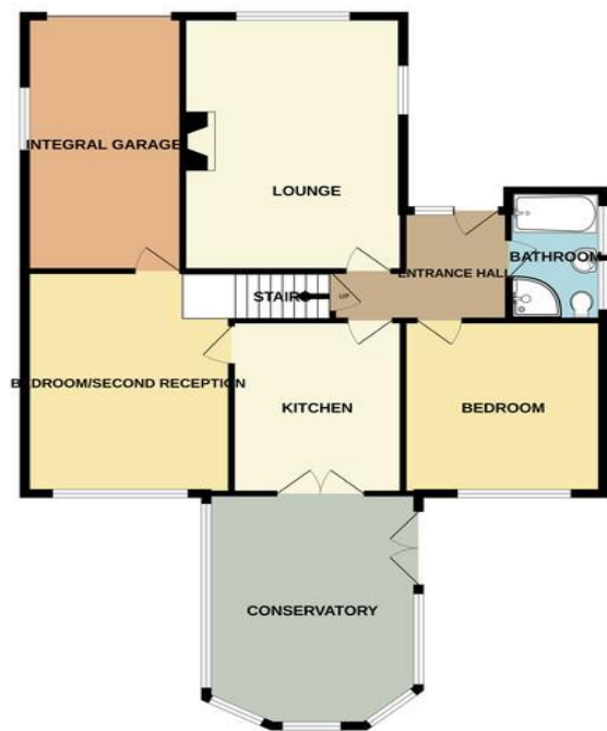
GROUND FLOOR 1098 sq.ft. (102.0 sq.m.) approx.