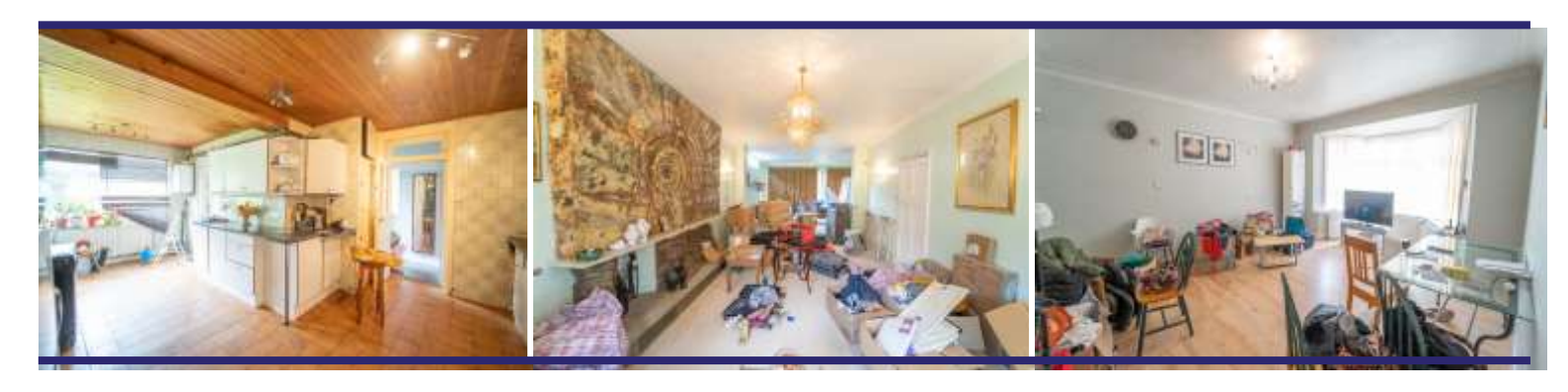
GROUND FLOOR 1769 sq.ft. (164.4 sq.m.) approx.