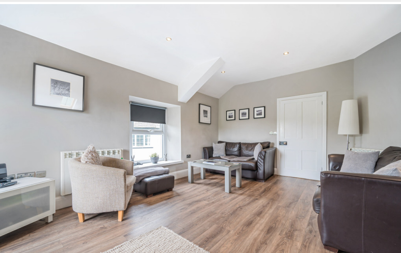
Open Plan Living Room / Dining Kitchen