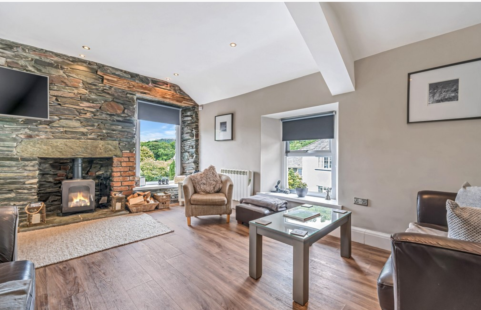
Open Plan Living Room / Dining Kitchen