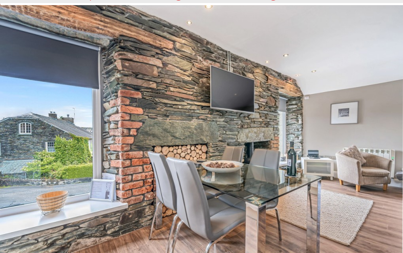
Open Plan Living Room / Dining Kitchen

With window, roof window, electric radiator.