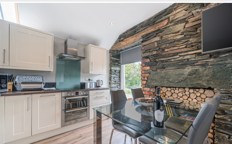
Open Plan Living Room / Dining Kitchen

With windows to two elevations, roof window, exposed Lakeland stone wall and inset fireplace with wood burning stove, two electric radiators, fitted base and wall units including pelmet lighting, sink with mixer tap, ceramic wall tiling, integrated oven, hob, extractor unit, fridge / freezer, dish washer.