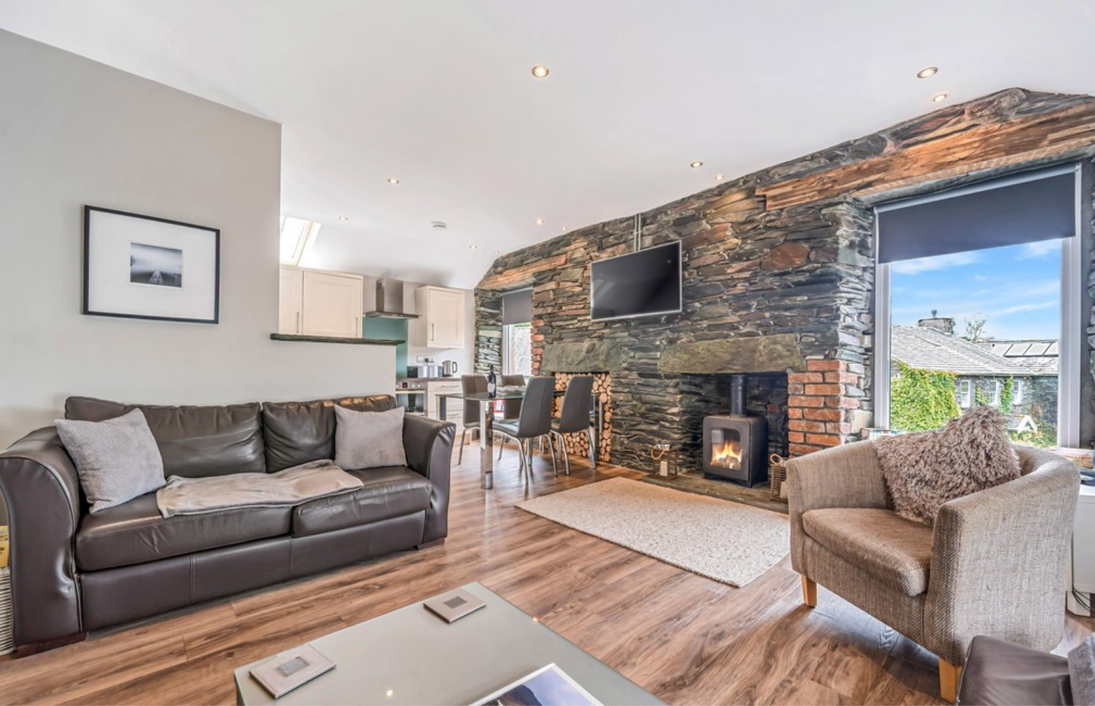
Open Plan Living Room / Dining Kitchen