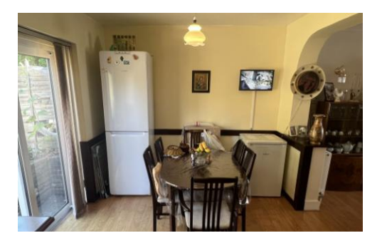
Whitton Avenue East, Greenford, UB6 OJP