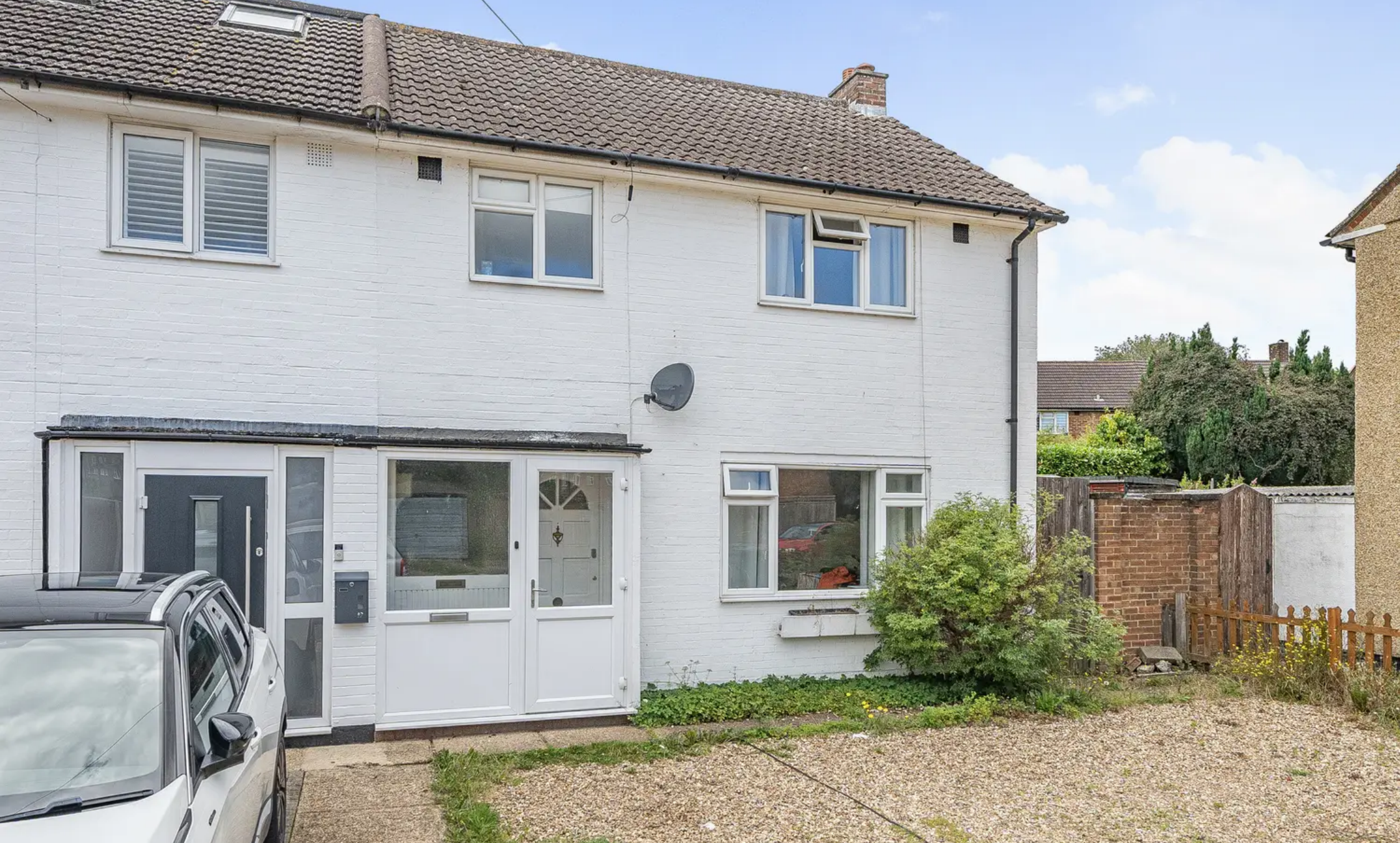
7 Homefield Gardens, Tadworth Tadworth