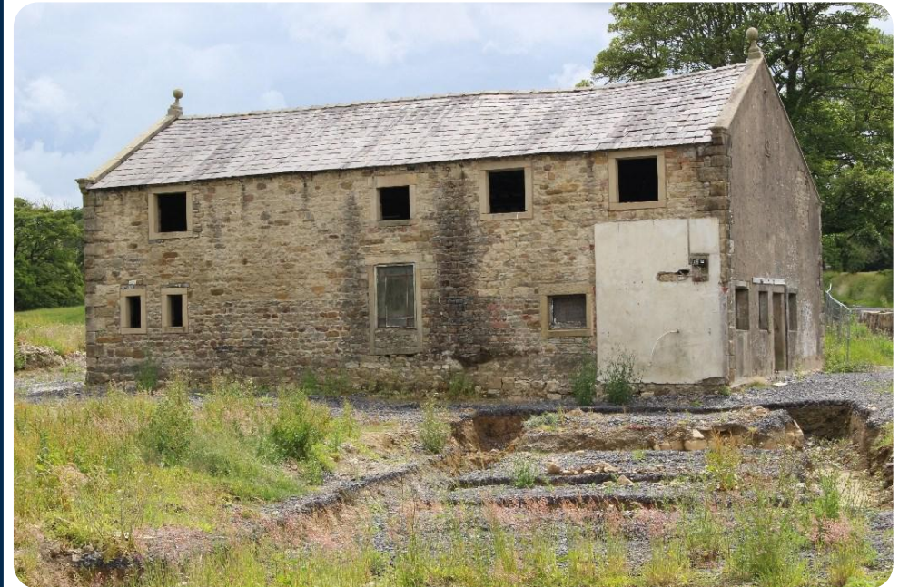
View to the South

Price offers in the region of £640,000 will be seriously considered.