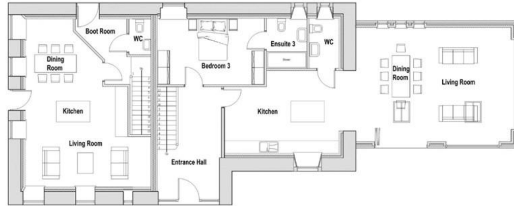
Proposed Ground Floor Plan 1:50 Scale