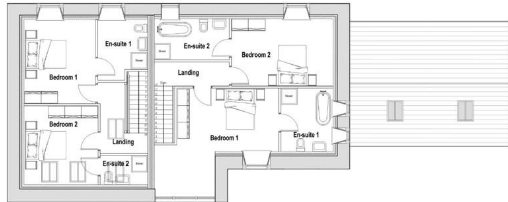
Proposed First Floor Plan 1:50 Scale