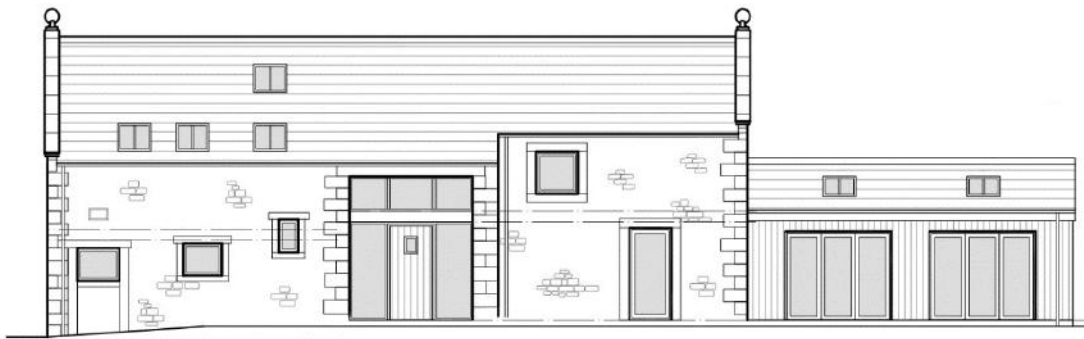
Barn Conversion – Front Elevation

Located off Slaidburn Road, approximately 4 miles from the busy market town of Clitheroe, and positioned to the south of the picturesque village of Newton in Bowland, Chapel Croft is ideally located in the idyllic rural Forest of Bowland AONB benefiting from expansive rural views whilst also being easily accessible.