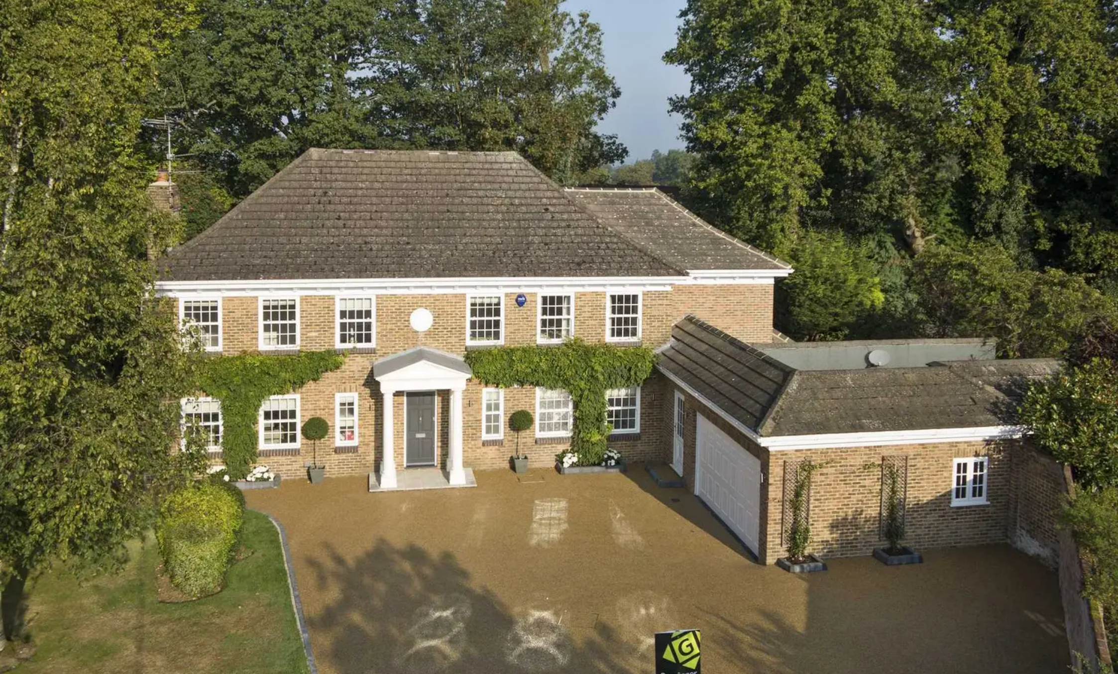
41 Burleigh Park, Cobham £8,500 pcm