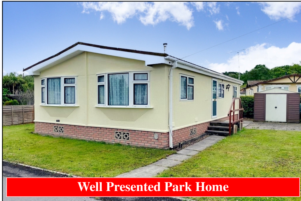
Well Presented Park Home

6 Holton Heath Park, Wareham Road, Holton Heath, Poole. BH16 6JS