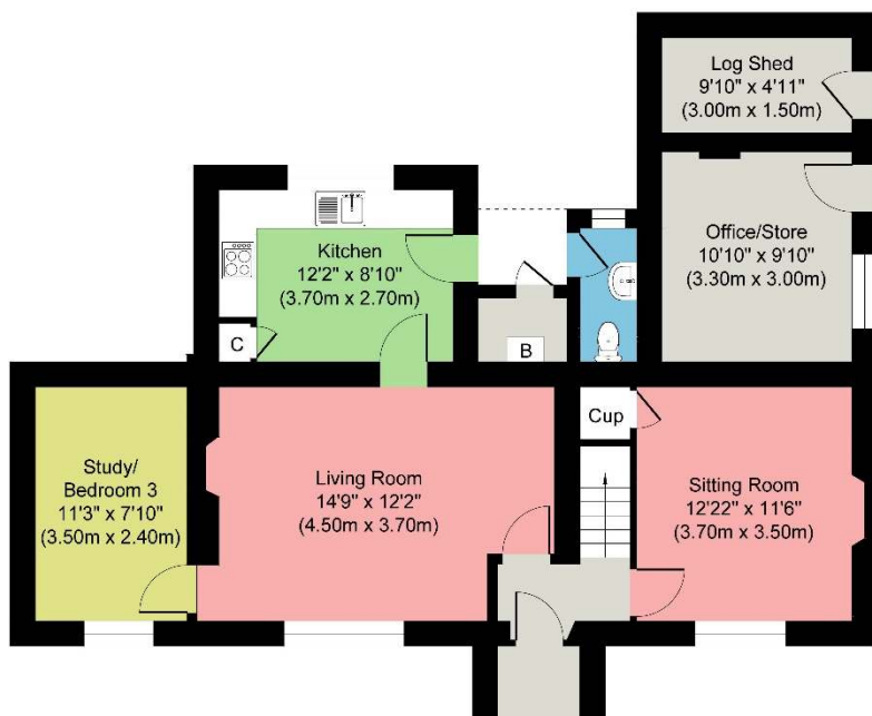
Ground Floor Approximate Floor Area 880 sq. ft (81.75 sq. m)