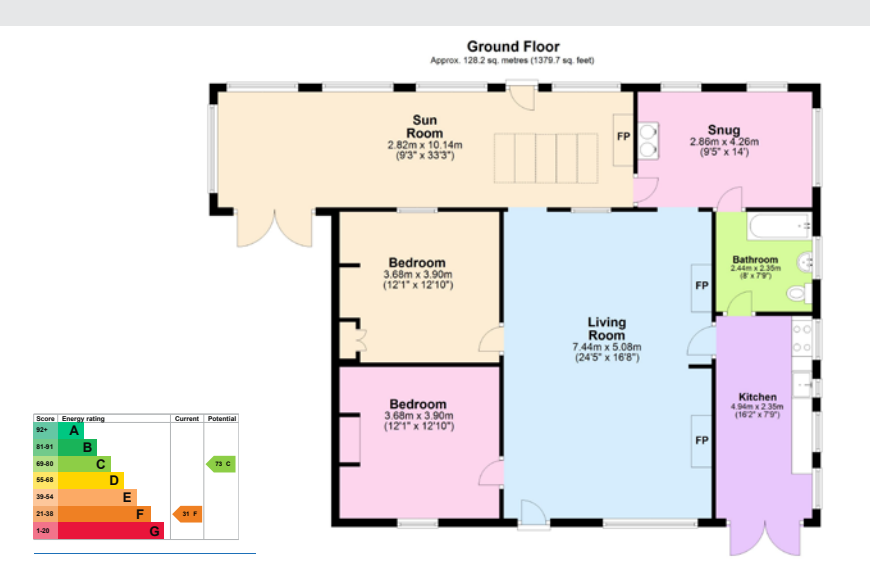
Total area: approx. 128.2 sq. metres (1379.7 sq. feet)

A brick garage under a slate roof with timber doors. There is a lean too off the garage with corrugated metal clad roof sheets. A large shed which is of a brick construction under a corrugated metal clad roof, currently used as stables.