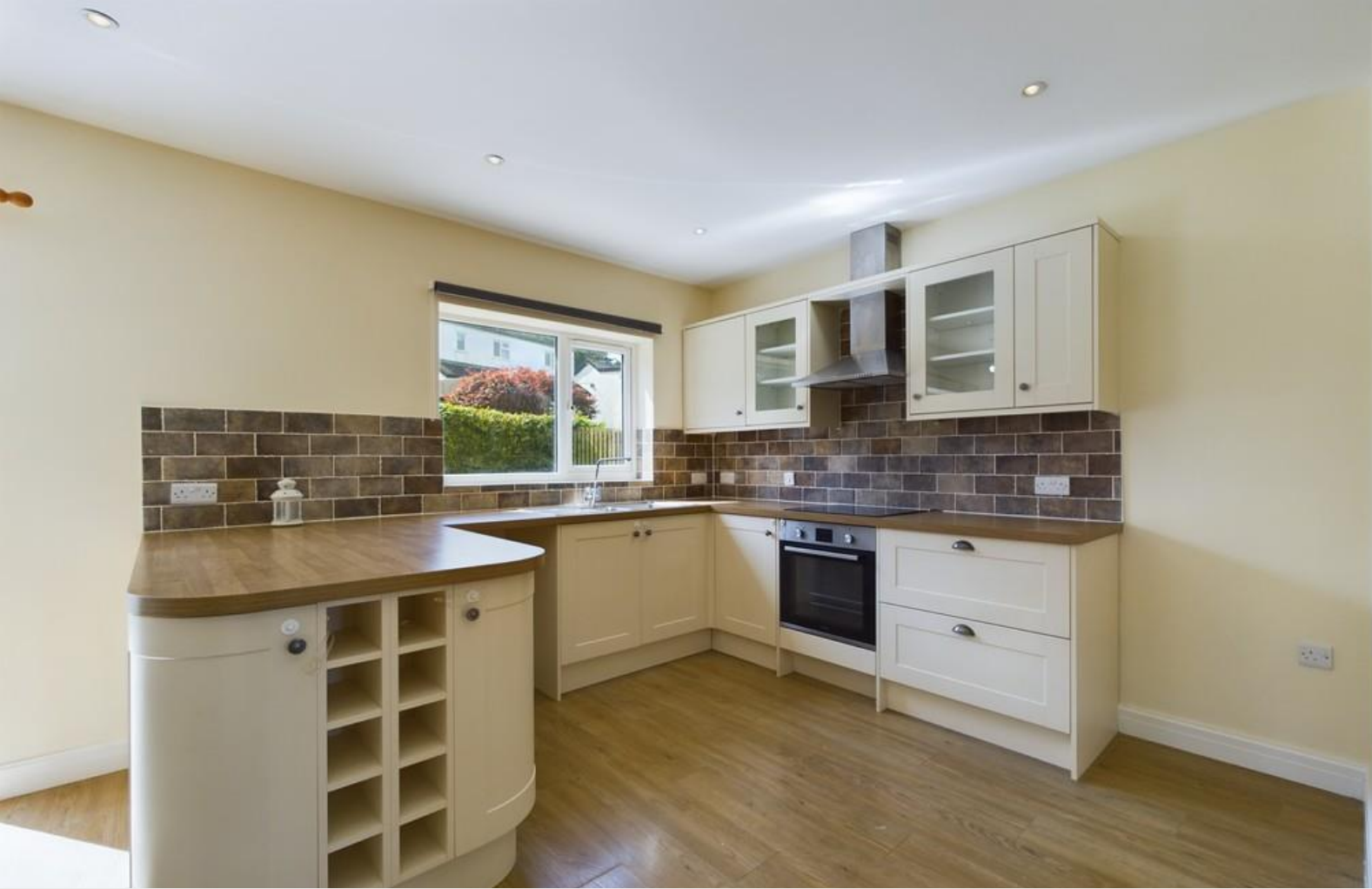
Spacious Kitchen Dining