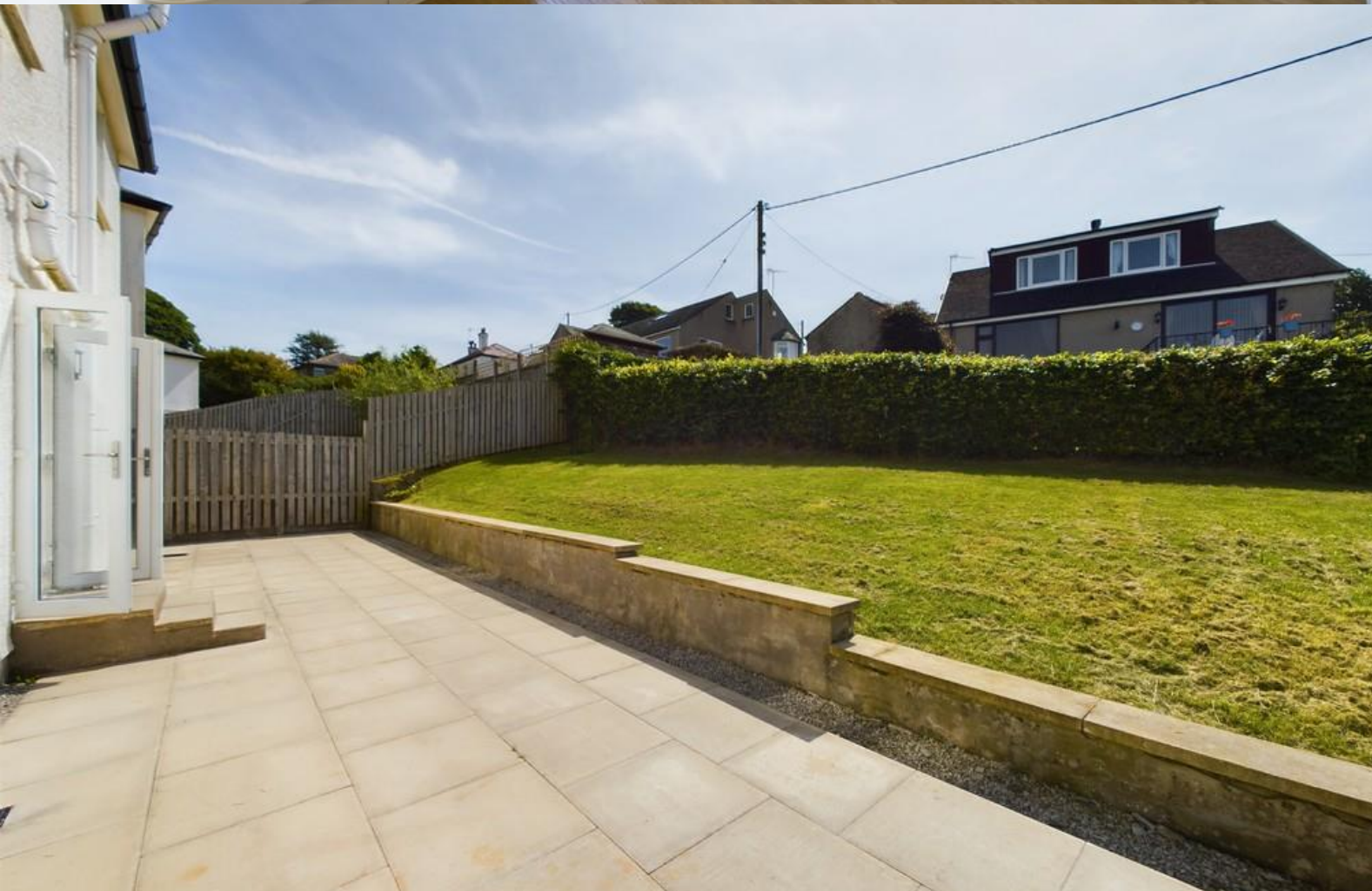
Rear Garden and Patio