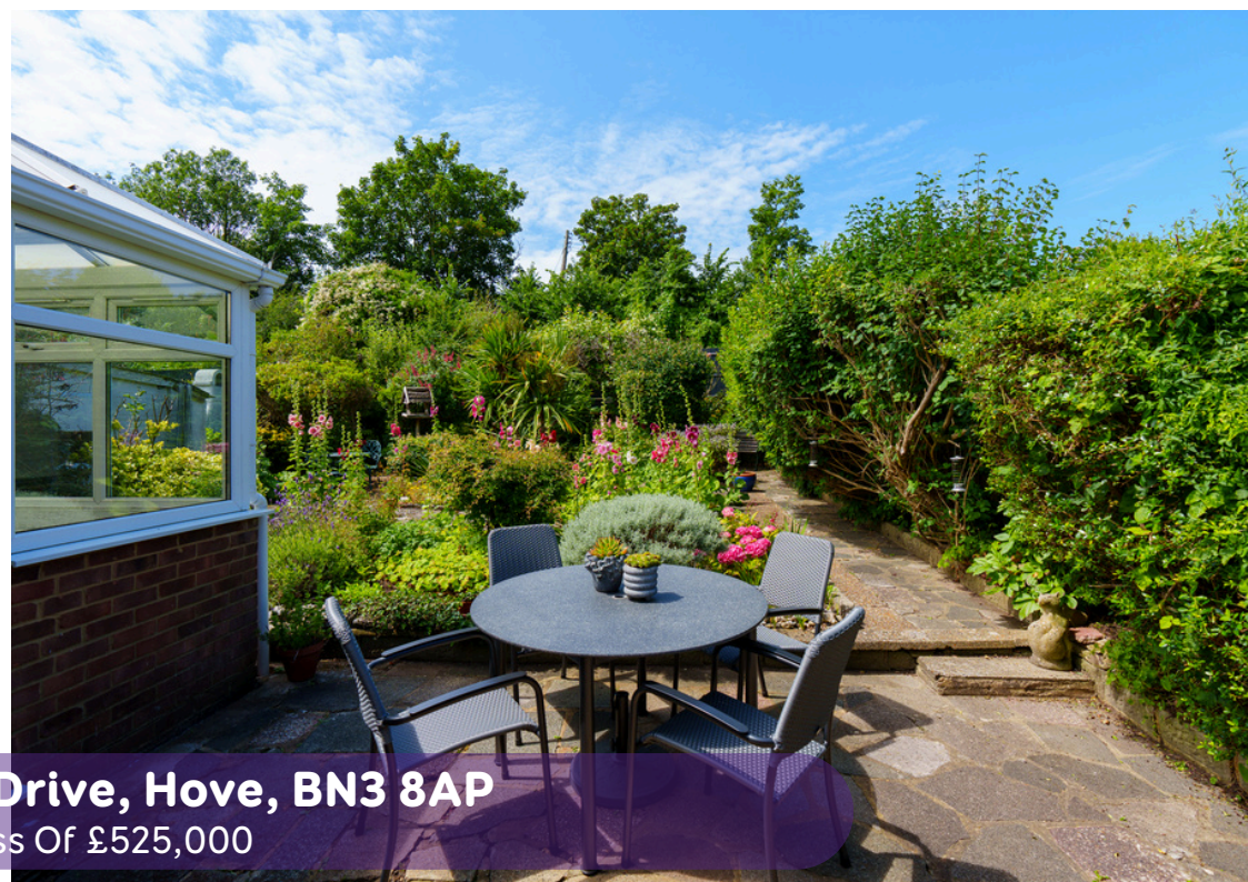
Hangleton Valley Drive, Hove, BN3 8AP Offers In Excess Of £525,000