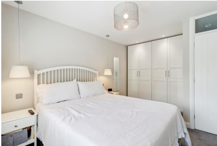
BEDROOM TWO 10' 10" x 10' 3" (3.3m x 3.12m) Skimmed ceiling. Double glazed window to front aspect. Radiator.