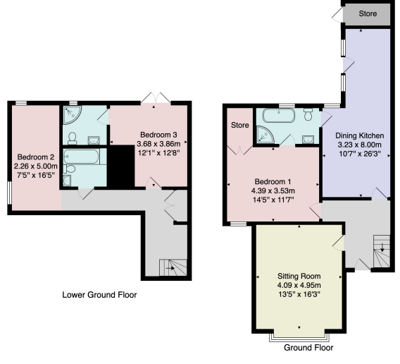
Total Area: 124.7 m² ... 1342 ft² All measurements are approximate and for display purposes only. No liability is accepted by either the agency or Box Propenty Sublinors Ltd as to the exact measurements of the rooms. Box Propenty Solutions Ltd retains the copyright on this plain and allows agents to use it with agreed permission.