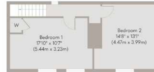
First Floor Approximate Floor Area 435 sq. ft (40.41 sq. m)