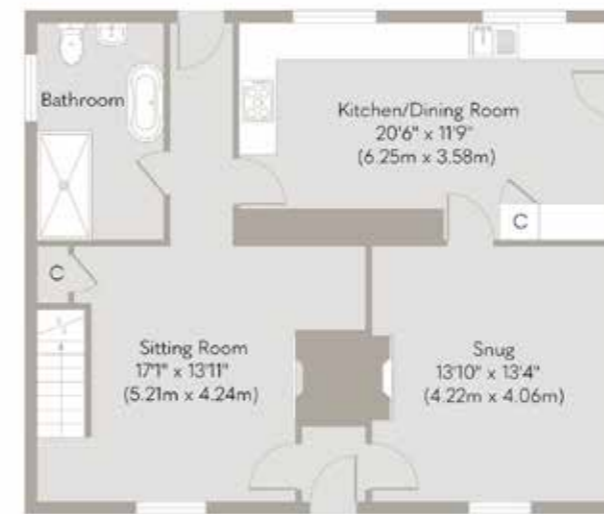
Ground Floor Approximate Floor Area 814 sq. ft (75.62 sq. m)