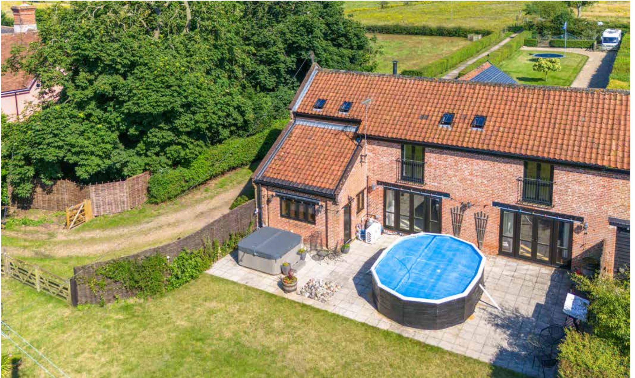
Walnut Tree Barn Homersfield, Harleston | Norfolk | IP20 0EX