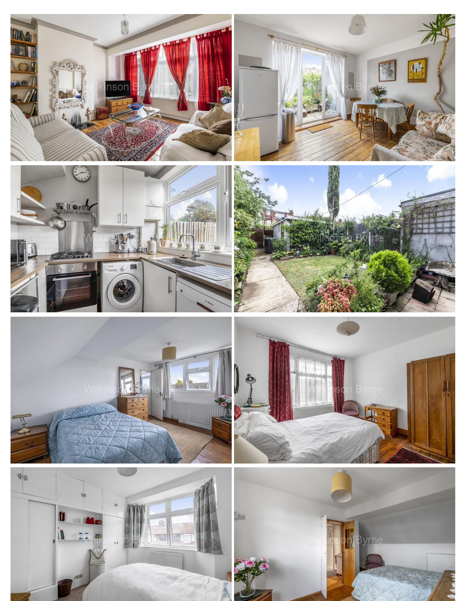
These particulars, whilst believed to be accurate set out as a general outline only for guidance and do not constitute any part of an offer or contract. Intending purchasers should not rely on them as fittings. Room sizes should not be relied upon for carpets and furnishings. The measurements given are approximate. No person in this firm's employment has the authority to make or give any representation or warranty in respect of the property.