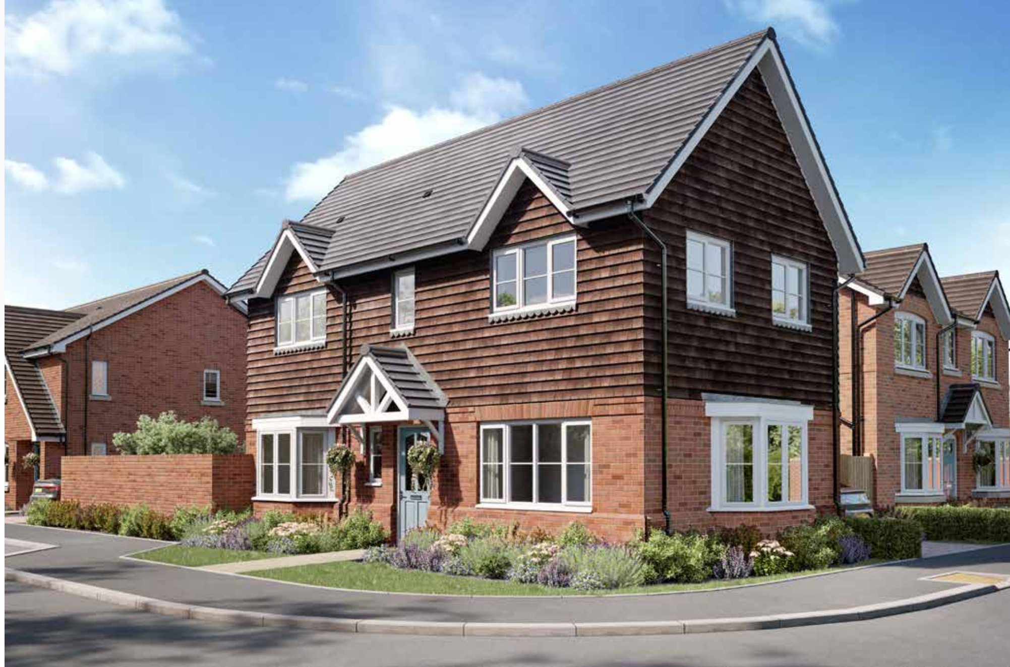
Built with you in mind