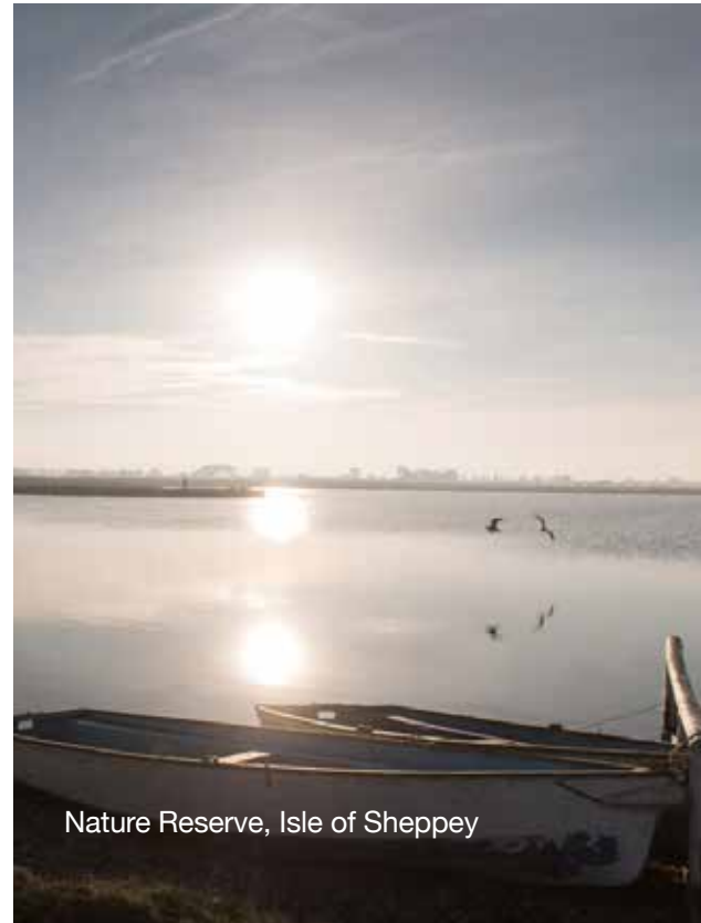
Nature Reserve, Isle of Sheppey