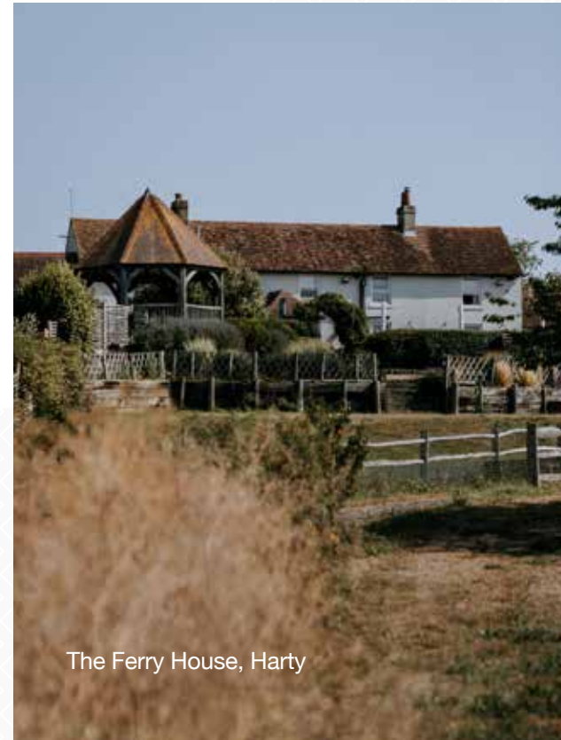
The Ferry House, Hartley