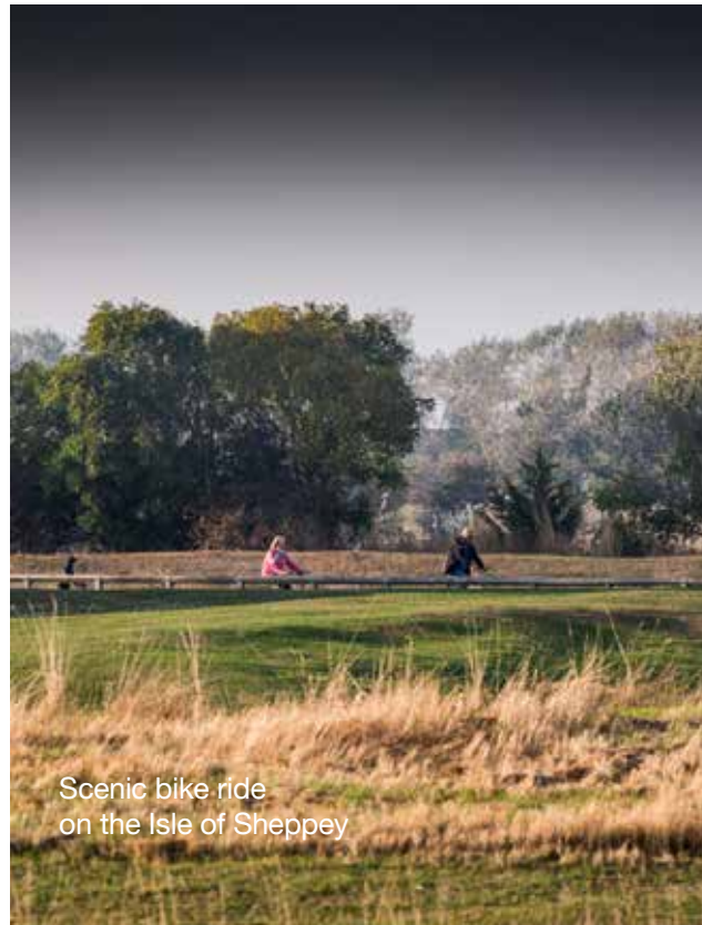
Scenic bike ride on the Isle of Sheppey

A tranquil oasis, yet just a stone's throw from a host of modern amenities and attractions, Minster on Sea really is the perfect place to call home.