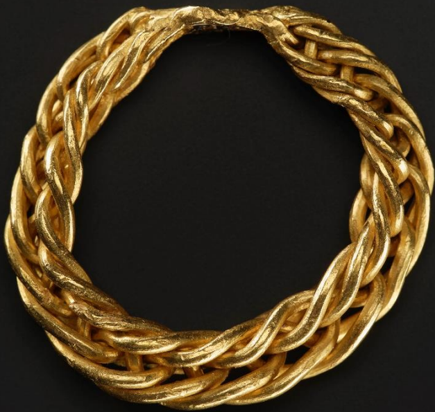
11 th century Viking gold ring found on Fladdah-Chuain in 1851