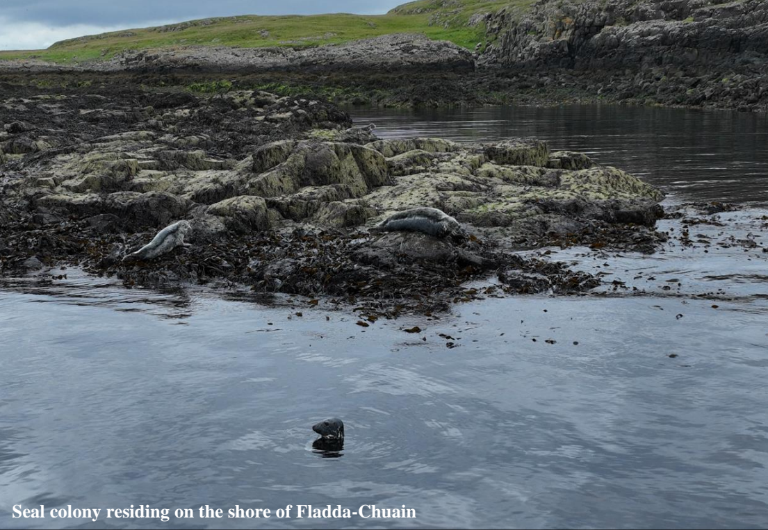
Seal colony residing on the shore of Fladda-Chuain