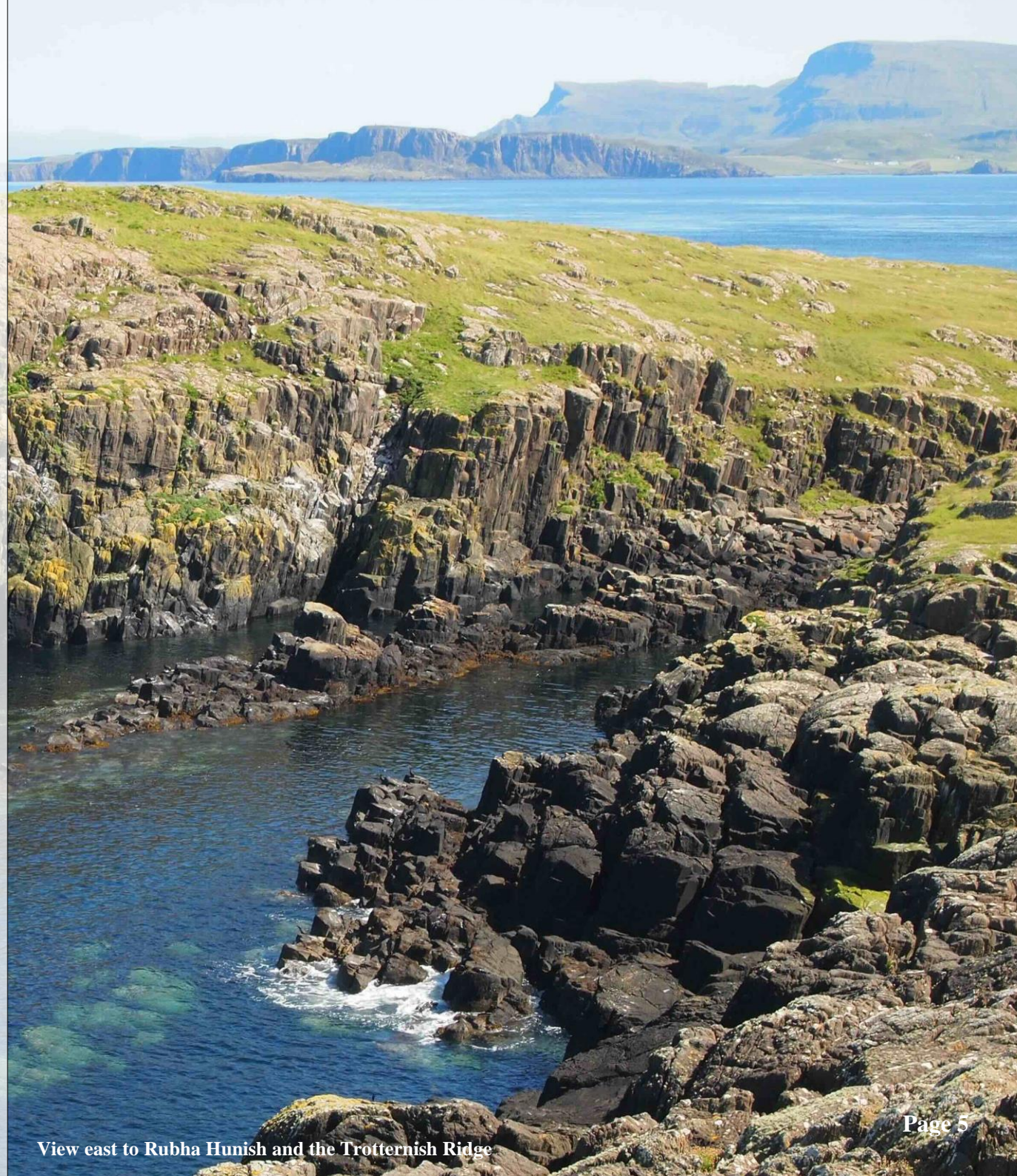
View east to Rubha Hunish and the Trotternish Ridge

To locate the island, please refer to location and sale plans within these particulars. The What3Words code is: Pull.Island.Beaks and the grid reference is: NG 362 810.