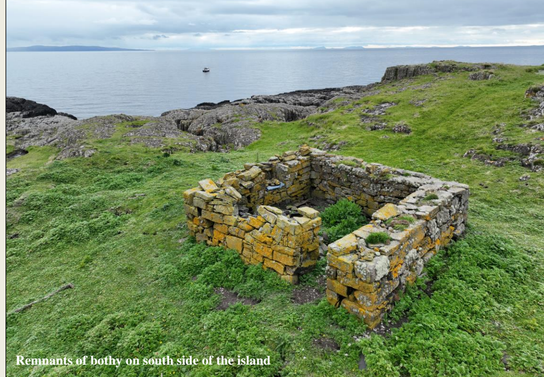
Remnants of bothy on south side of the island