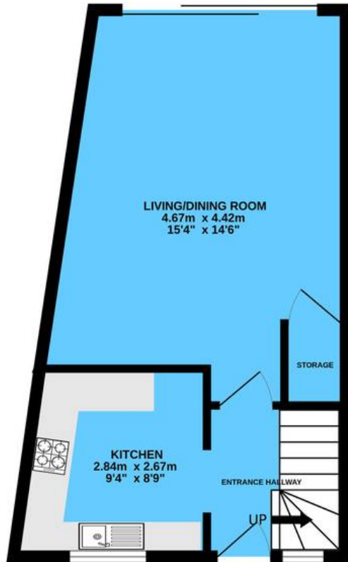
GROUND FLOOR 33.4 sq.m. (360 sq.ft.) approx.