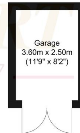
Garage Approximate Floor Area 96.87 sq ft (9.0 sq m)