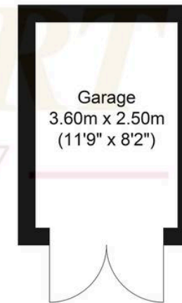
Garage Approximate Floor Area 96.87 sq ft (9.0 sq m)